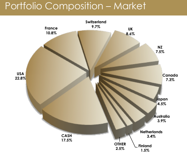
Total Number of Securities: 61

Please see separate risk disclosure statement on the next page for further important information.